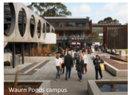
Waurn Ponds campus

Deakin College course taught on this campus: Diploma of Commerce.